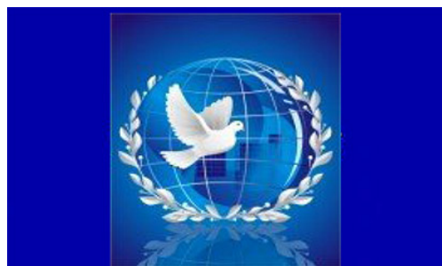
Flag of USE

Each Citizen according to ancient philosophical postulates is considered as a part of a State. Thus, in our case each Citizen of the Earth as a person shall be considered as a part of the USE .